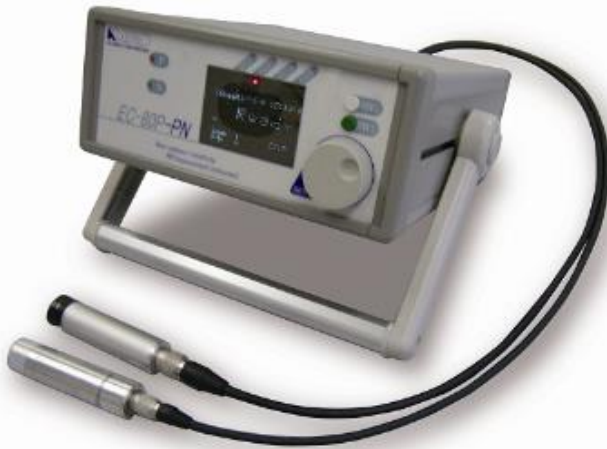
*EC-80P-PN (Rs measurement + PN checker probe)

Sheet resistance/resistivity measurement instrument [Hand held probe type, Eddy current method]